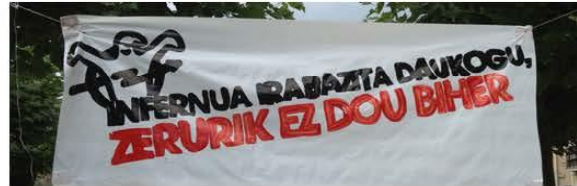
Banner in Elorrio: “We have won hell. We don’t need heaven”