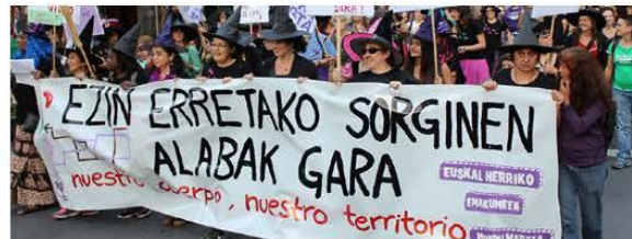
Feminist march in Bilbao: “We are the daughters of the witches you couldn’t burn. Our body, our land!”