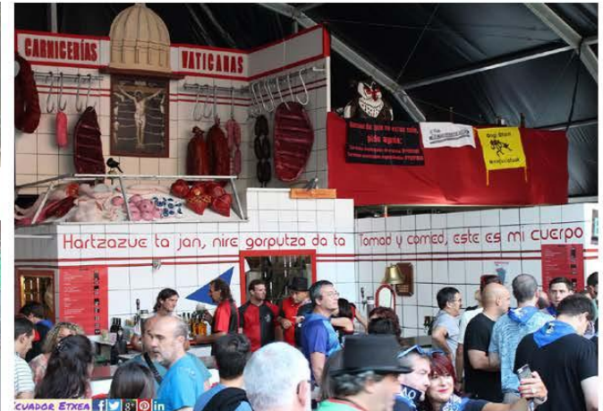
A temporary bar (txosna) during festivals in Bilbao decorated as a Vatican Butchers , depicting Jesus and his body as pieces of meat.