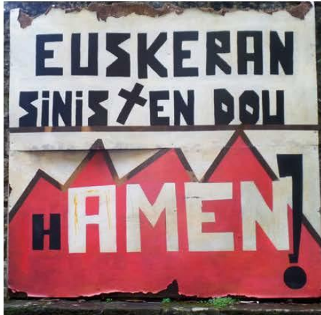
Basque street sign that says: “We believe in Basque here” (i.e. not Christianity)

A hostile struggle for Basque independence from France and Spain has existed for centuries. Christianity has often been used to justify oppression against Basque people, from burning “witches” to outlawing the language. It is no surprise therefore to see a significant social departure from the state-imposed religion by a suspicious, resentful and even angry demographic. Furthermore, many Basques are quick to embrace anything but Christianity, with special attention given to mythology, new-age and pagan beliefs that are a tempting, fertile pasture for the spiritually inquisitive.